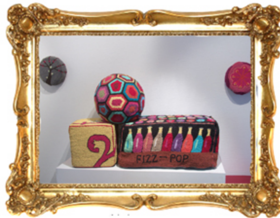
MUM's at Rauma Art museum 2010