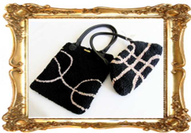
Anu Penttinen's designs 2008