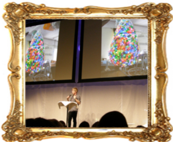
Heath Nash at Pecha Kucha, Helsinki -09