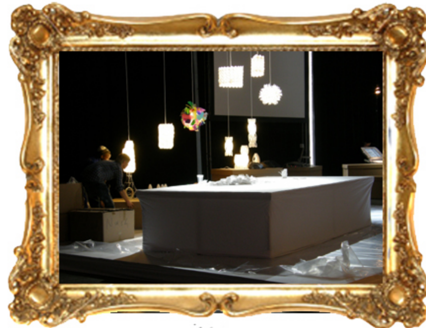
MUM's brought Heath Nash for Helsinki Design Week 2009. Exhibition and workshops at Cable Hall and Habitare