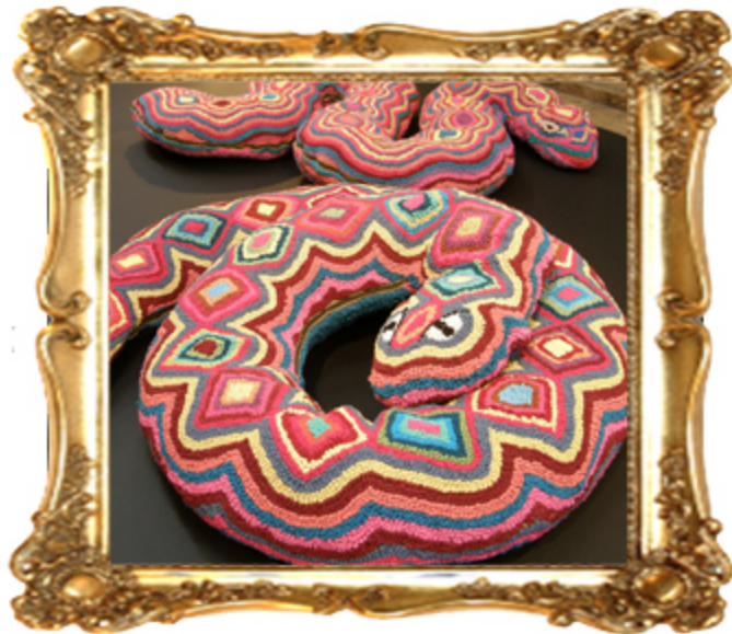
MUM's at Fiskars summer exhibition 2009