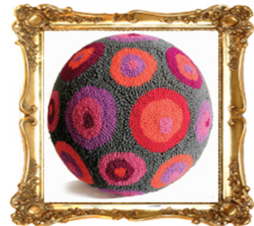
Winner at Playful Interior 2010 Designed by MUM's